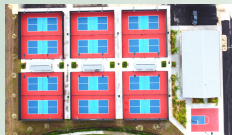
Aerial view of the award winning Timber Pines Pickleball Club courts.

Timber Pines Pickleball Club provides opportunities for their members to socialize and connect through various scheduled play and club events. One of their most popular weekly events is a social ABCD event which attracts the maximum number of players. The club also uses Pickleball Den to schedule their weekly Saturday cookout and to communicate with members by sending a weekly newsletter.